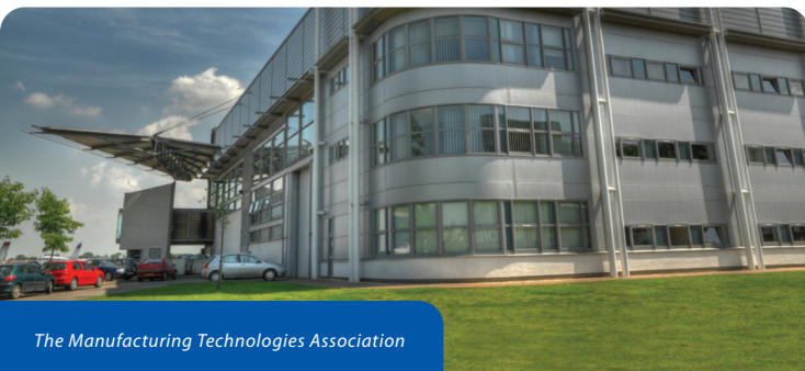
The Manufacturing Technologies Association

T: +44 (0)20 7298 6400 F: +44 (0)20 7298 6430 E: info@mta.org.uk W: www.mta.org.uk